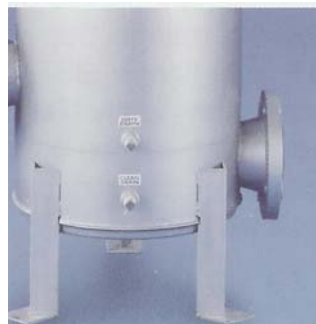
Flange fittings with legs