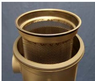
Stainless steel baskets