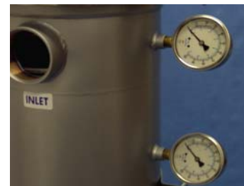
Differential gauge ports